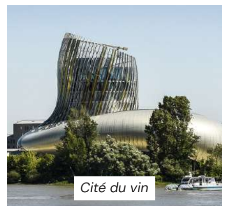
Cité du vin