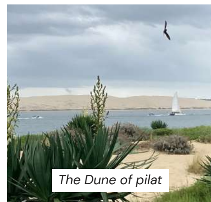
The Dune of pilat