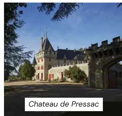
Chateau de Pressac