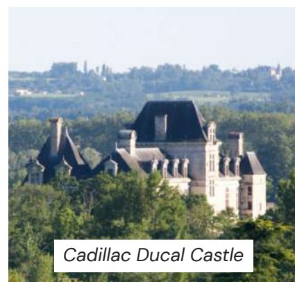
Cadillac Ducal Castle