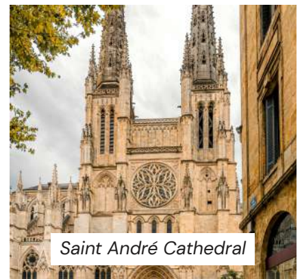
Saint André Cathedral