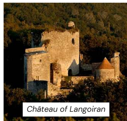
Château of Langoiran