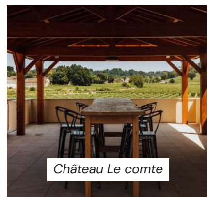
Château Le comte